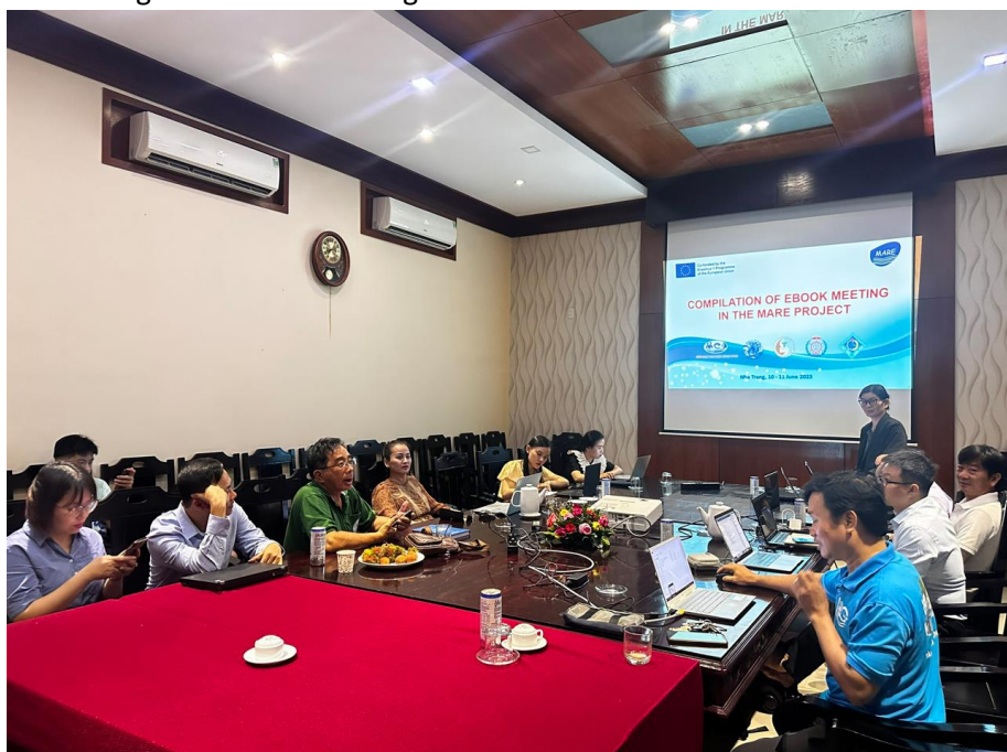
View of the meeting to compile the ebook