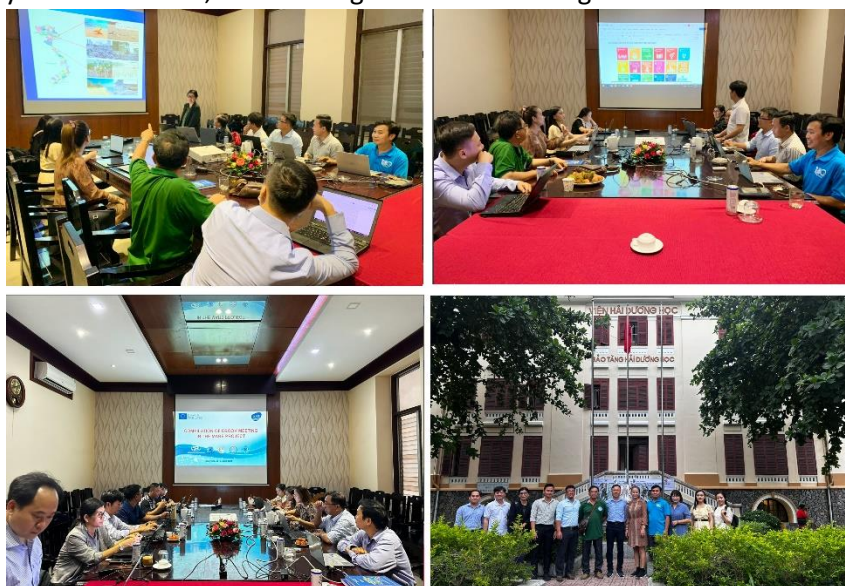
Photos taken in 2 days of ebook meeting at VNIO

After two days of active work, the meeting ended and was a great success.