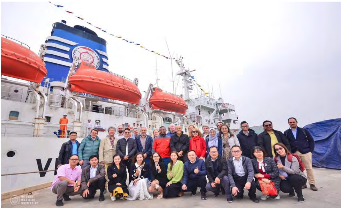
MARE Member Schools/Institutes visited VMU Viet-Han training ship

University's simulator training room and classrooms have been renovated and updated at regional and international standards. The training ship VMU VIET- KOREA is equipped with full real-time simulation systems, capable of receiving 152 students at the same time and unlimited international navigation ability. The VMU VIET- KOREA training ship with experienced and knowledgeable lecturers of the University will boost the standard of marine training to keep up with the advanced countries of the continent.