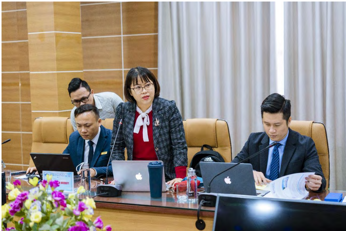
Reporting on the implementation of VMU's preparation of teaching materials and implementation of courses under MARE's WP1