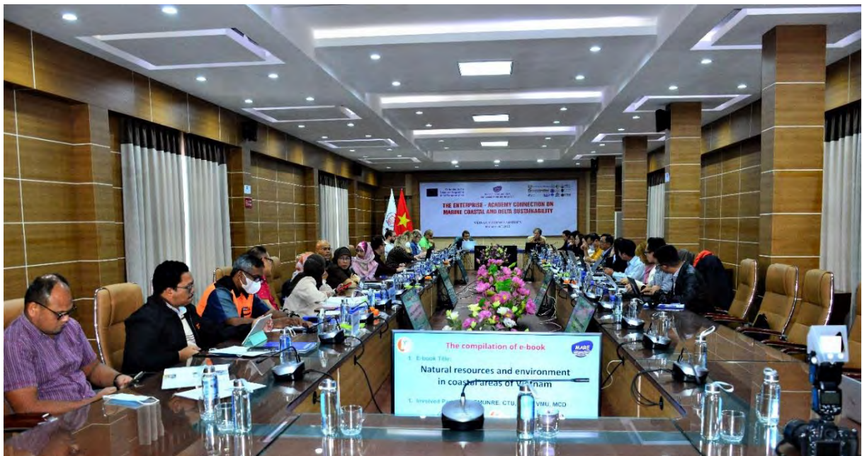
Reporting on the compilation of e-book by HCMC-UNRE