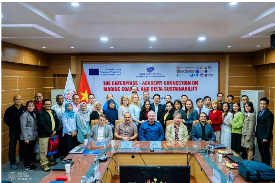
The MARE project meeting and Workshop on the enterprise-academy connection on marine coastal and delta sustainability

After the Seminar, all participants joined the group picture.