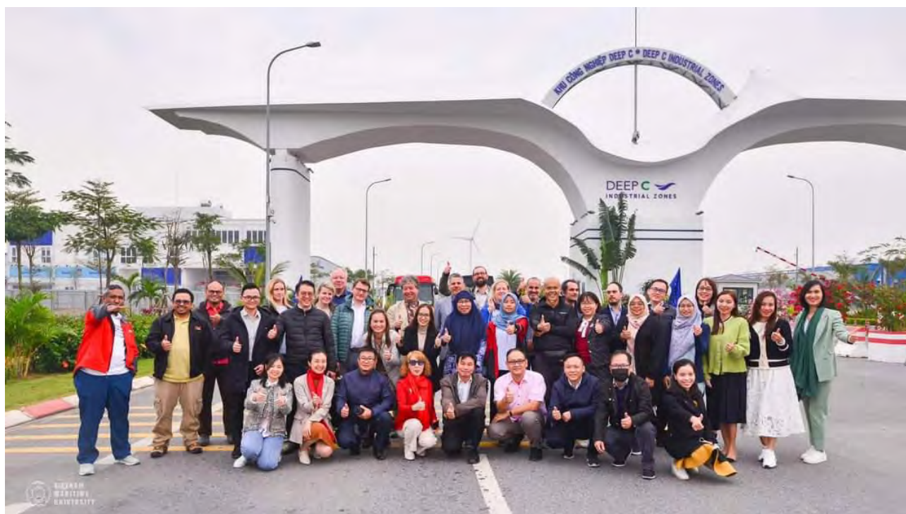
MARE Member Schools/Institutes visited DEEP C Industrial Zone