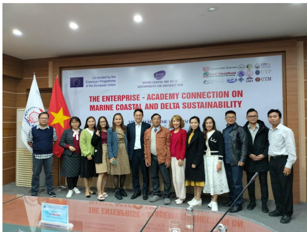
Figure 7. Group photo of delegates attending the meeting