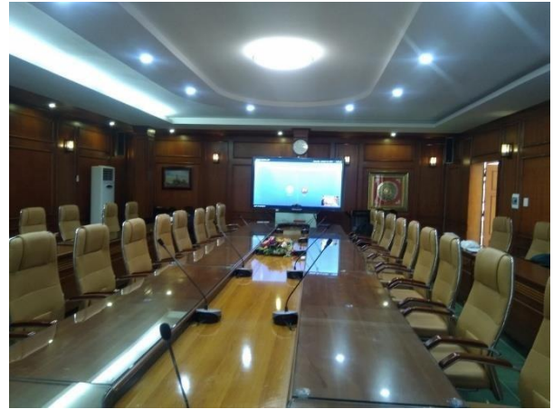
Figure 1. The meeting room equipped with MARE facilities

Moreover, to ensure the long-term use of the equipment, we have taken a number of measures such as preserving, cleaning and affixing instruction labels on the equipment.